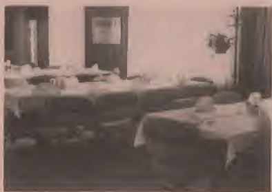
Banquet Rooms for Private Parties

7 miles south of Cannon Falls on Highway 52 (507) 263-5700